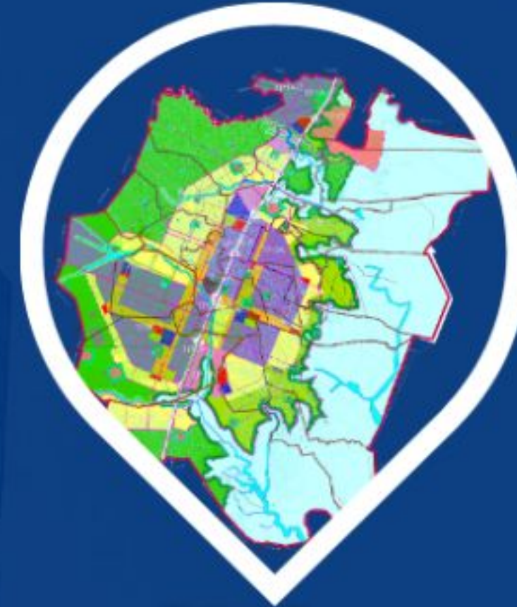
0 Km From TP 1 DHOLERA SIR