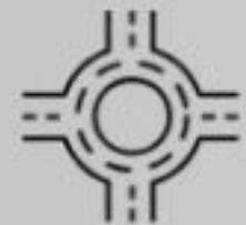
Road & Street Light