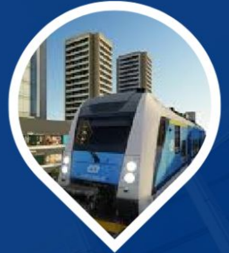
1 KM From Metro Rail