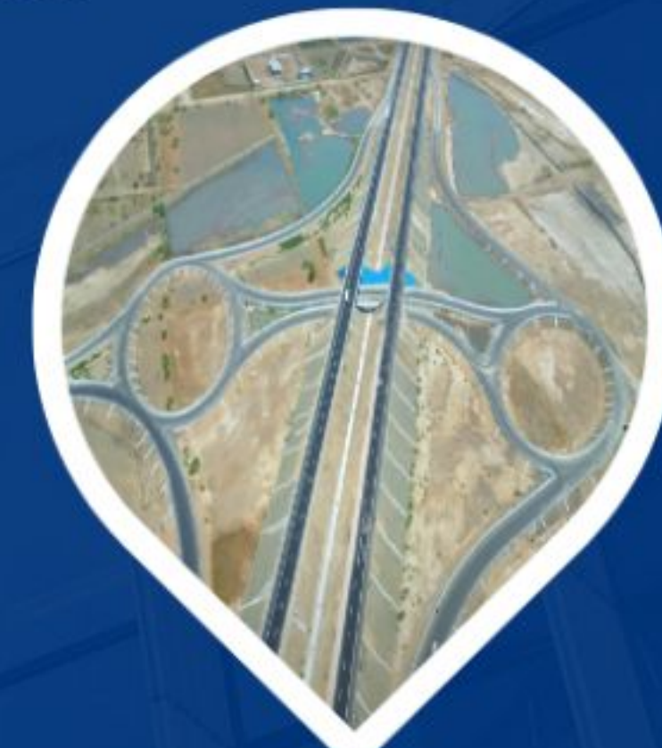
3 KM From Ambli Circle