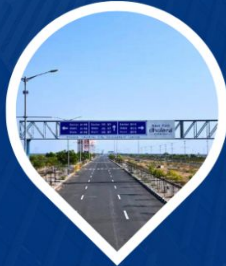
2 KM From Ahmedabad-Dholera Expressway