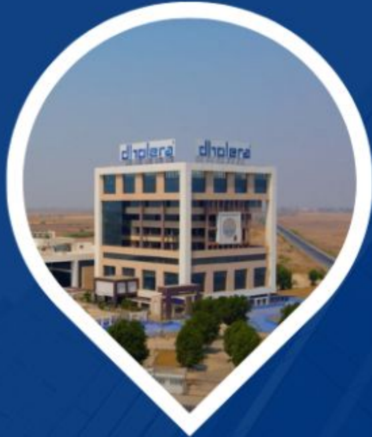
10 KM From ABCD Building