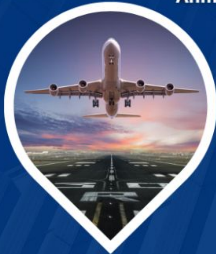
9 KM From Dholera International Airport