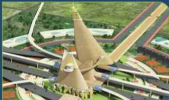
GUJARAT TRADE CENTER