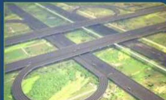
10 LAN HIGHWAYS