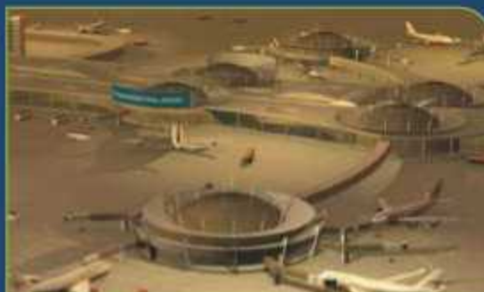
DHOLERA INTERNATIONAL AIRPORT